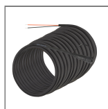
CONNECTOR SERIES 30M FIELD CABLE