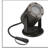
UNDERWATER LIGHT 8 CONNECTOR SERIES BRONZE